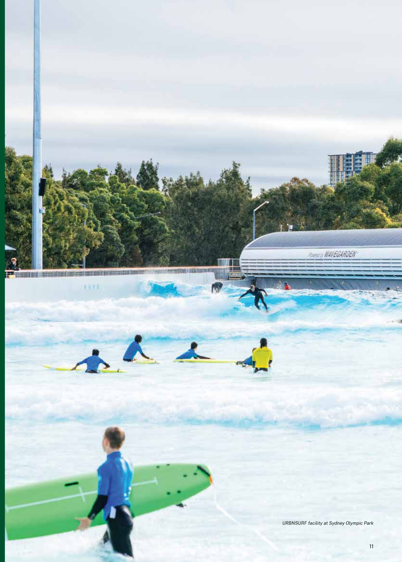
URBNSURF facility at Sydney Olympic Park

Ensuring the Office of Sport is sustainable, responsive and contemporary.