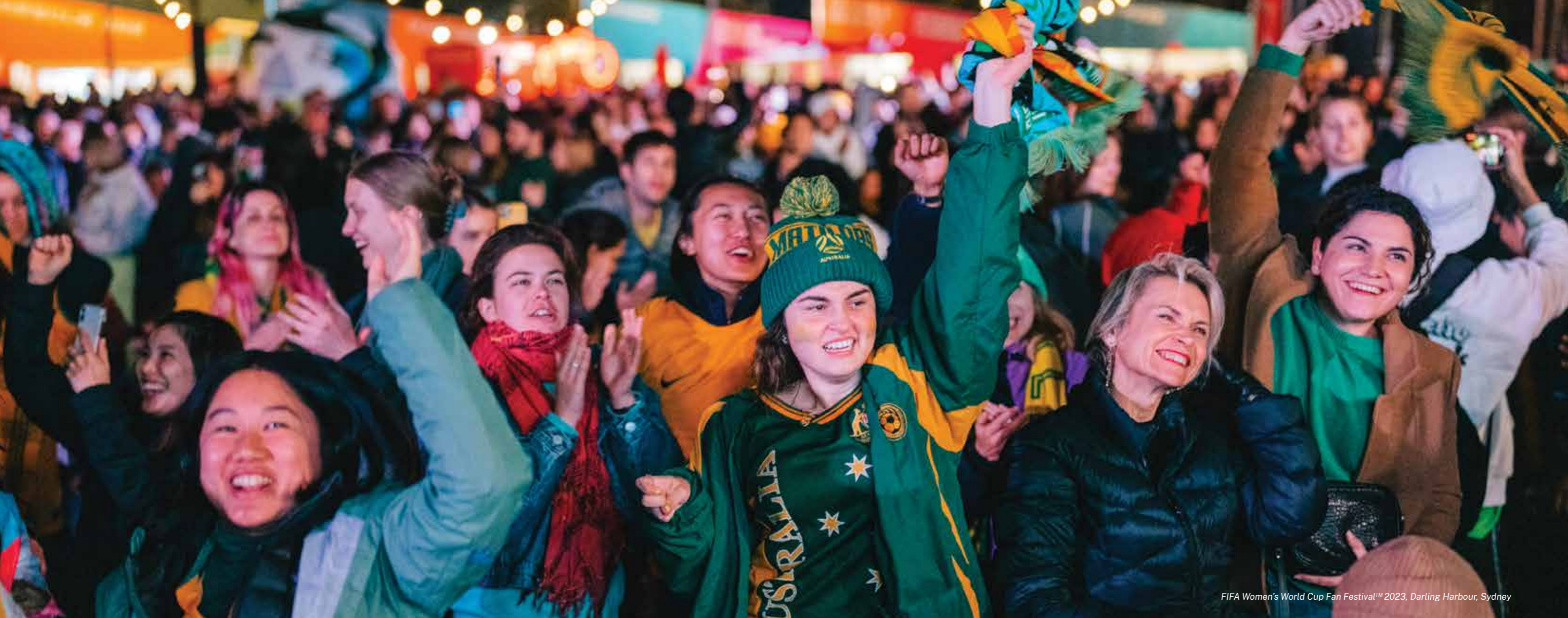
FIFA Women's World Cup Fan Festival™ 2023, Darling Harbour, Sydney