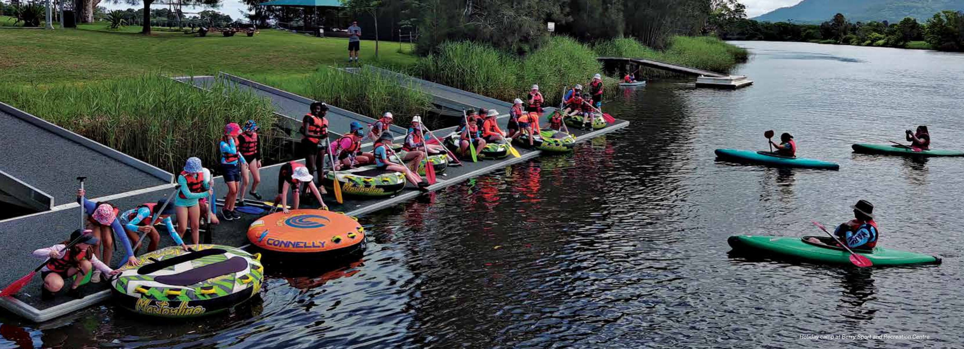
Holiday camp at Berry Sport and Recreation Centre