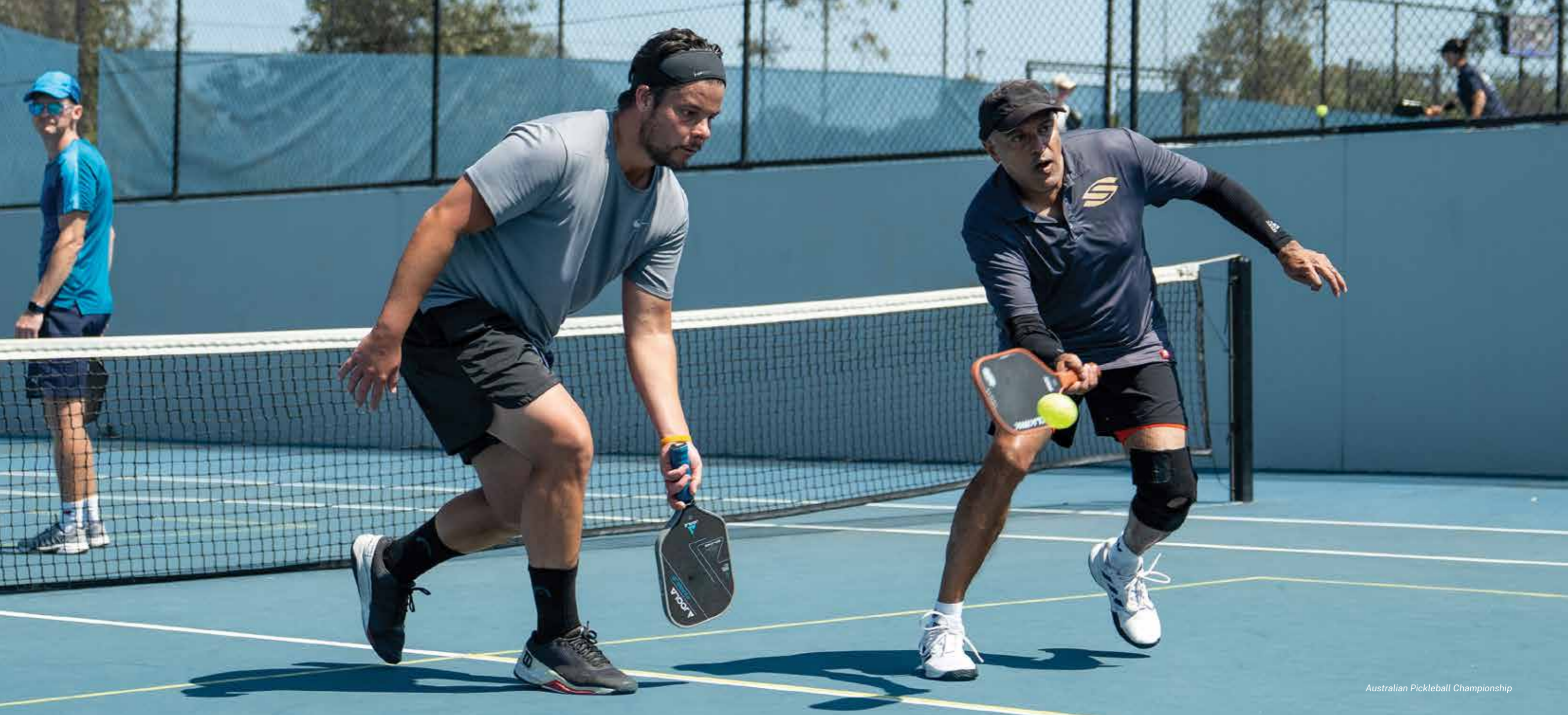
Australian Pickleball Championship