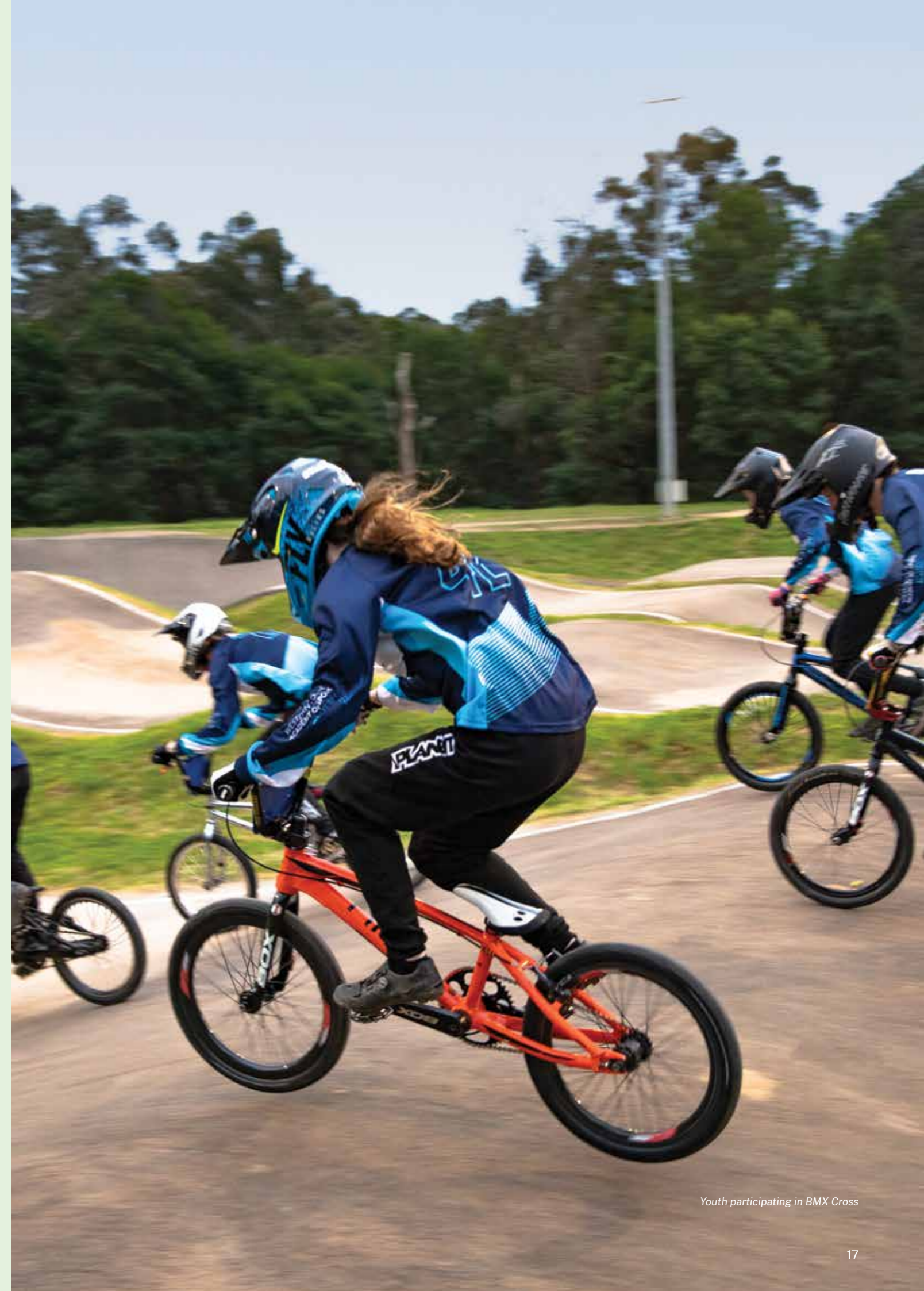
Youth participating in BMX Cross

From planning, funding and advocating for sport and active recreation facilities, through to operating a group of Sport and Recreation Centres and Olympic Sport Venues across the state, the Office of Sport is a key enabler of growing and strengthening the network of facilities and spaces in NSW.