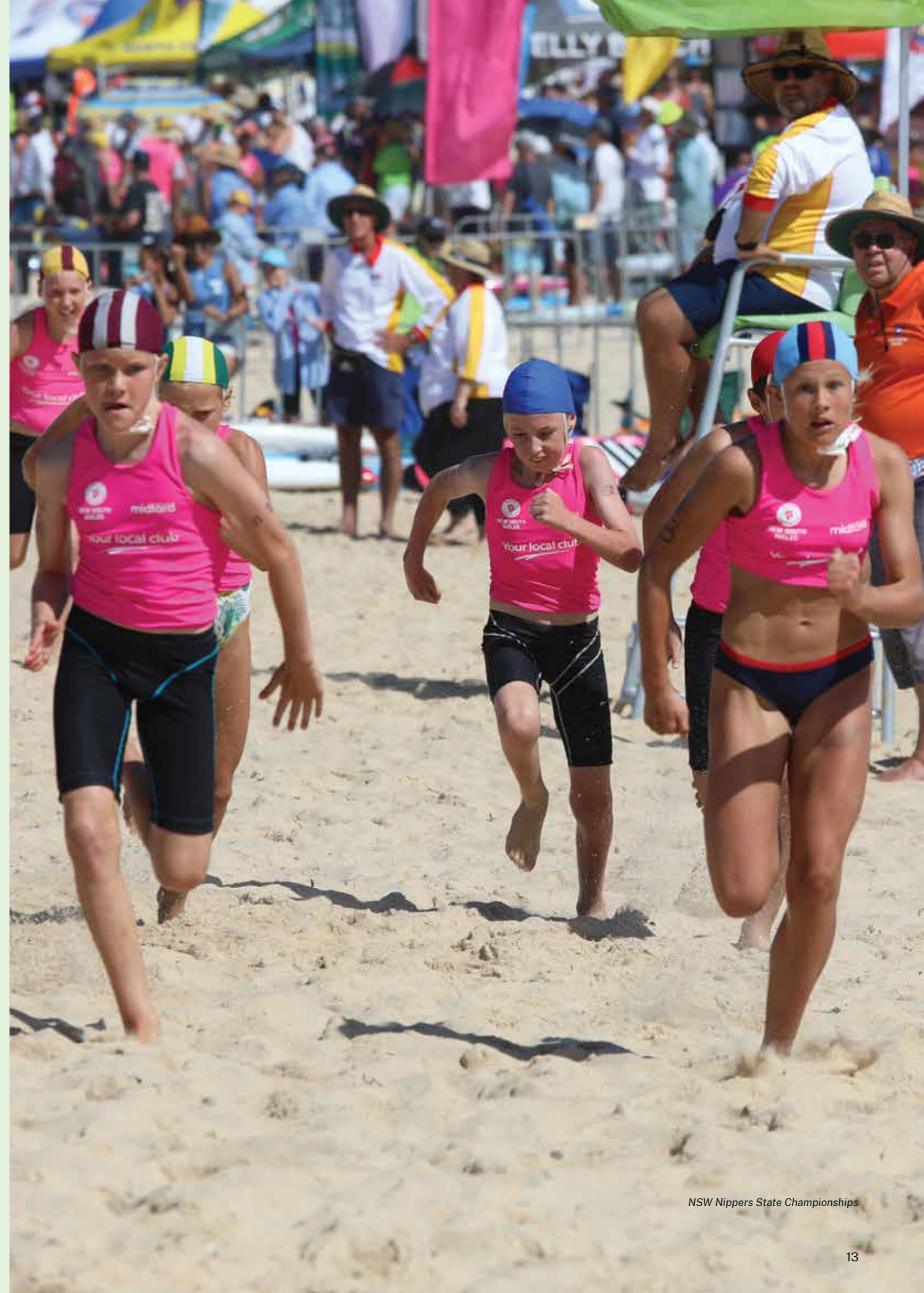
NSW Nippers State Championships

This focus on the organisational health and sustainability of the sport and active recreation sector ensures that future generations will continue to enjoy and benefit from the positive impacts of sport and active recreation, both socially and physically.