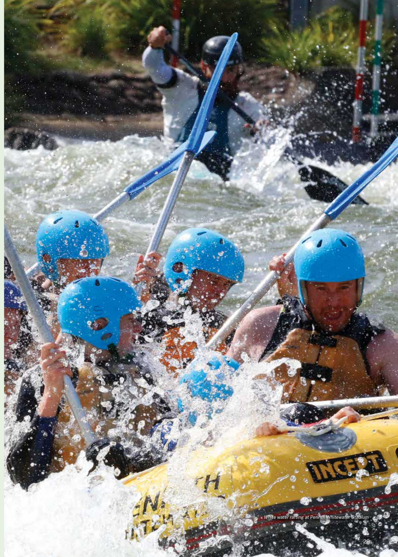
White water rafting at Penrith Whitewater Stadium

By fostering engagement with stakeholders, building partnerships and harnessing information and knowledge, the Office of Sport can stay ahead of the curve, remain agile and responsive, and drive continuous innovation and improvement.