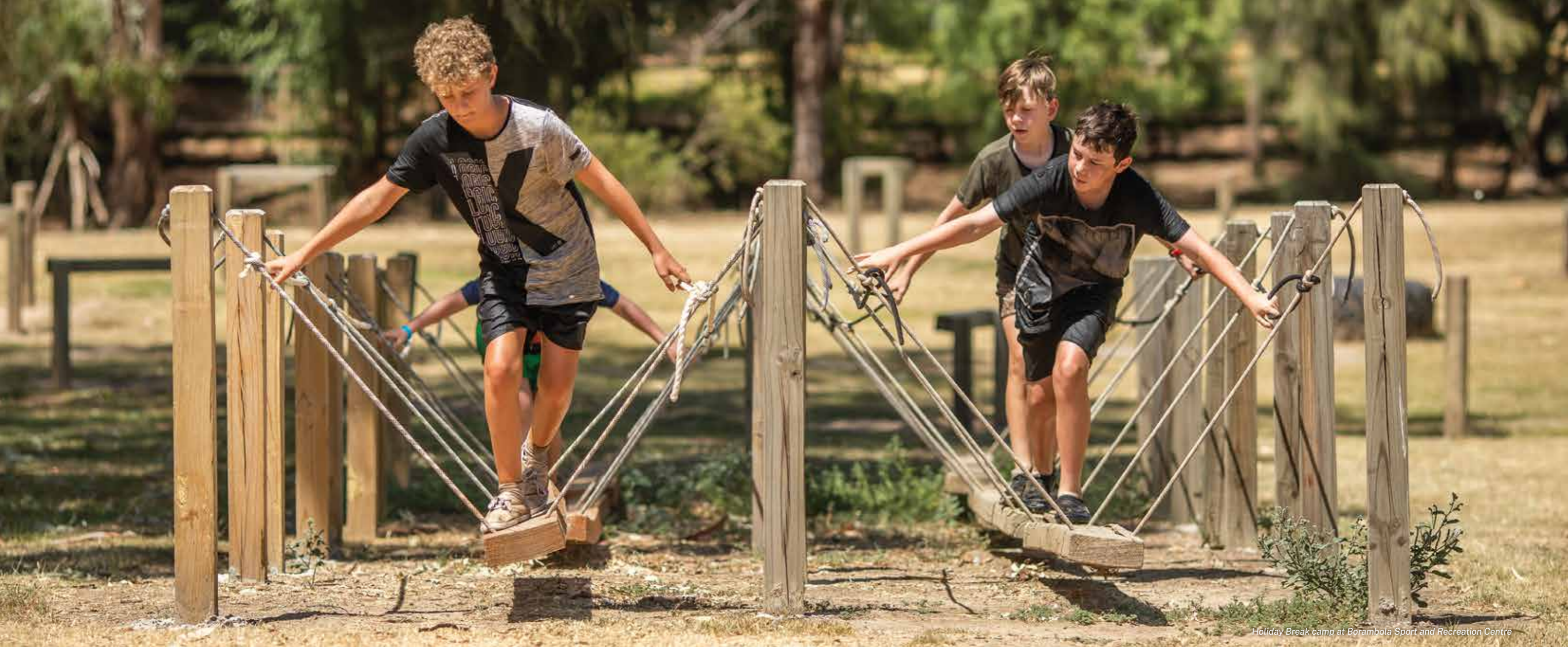
Holiday Break camp at Borambola Sport and Recreation Centre