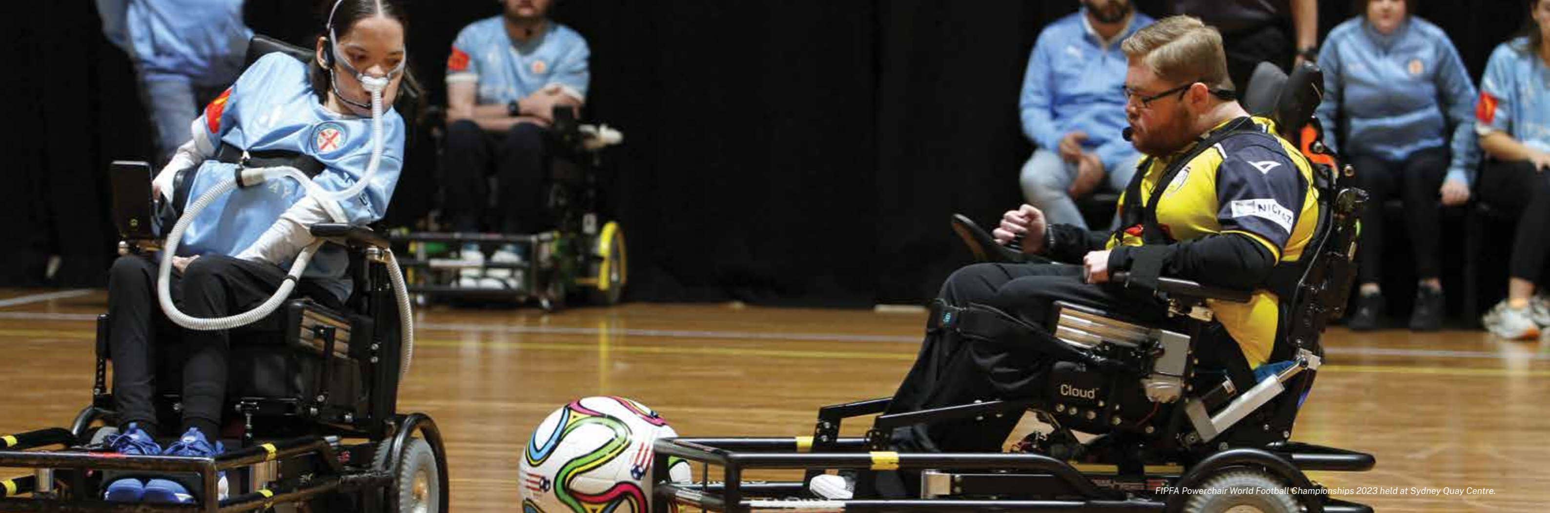
FIPFA Powerchair World Football Championships 2023 held at Sydney Quay Centre.