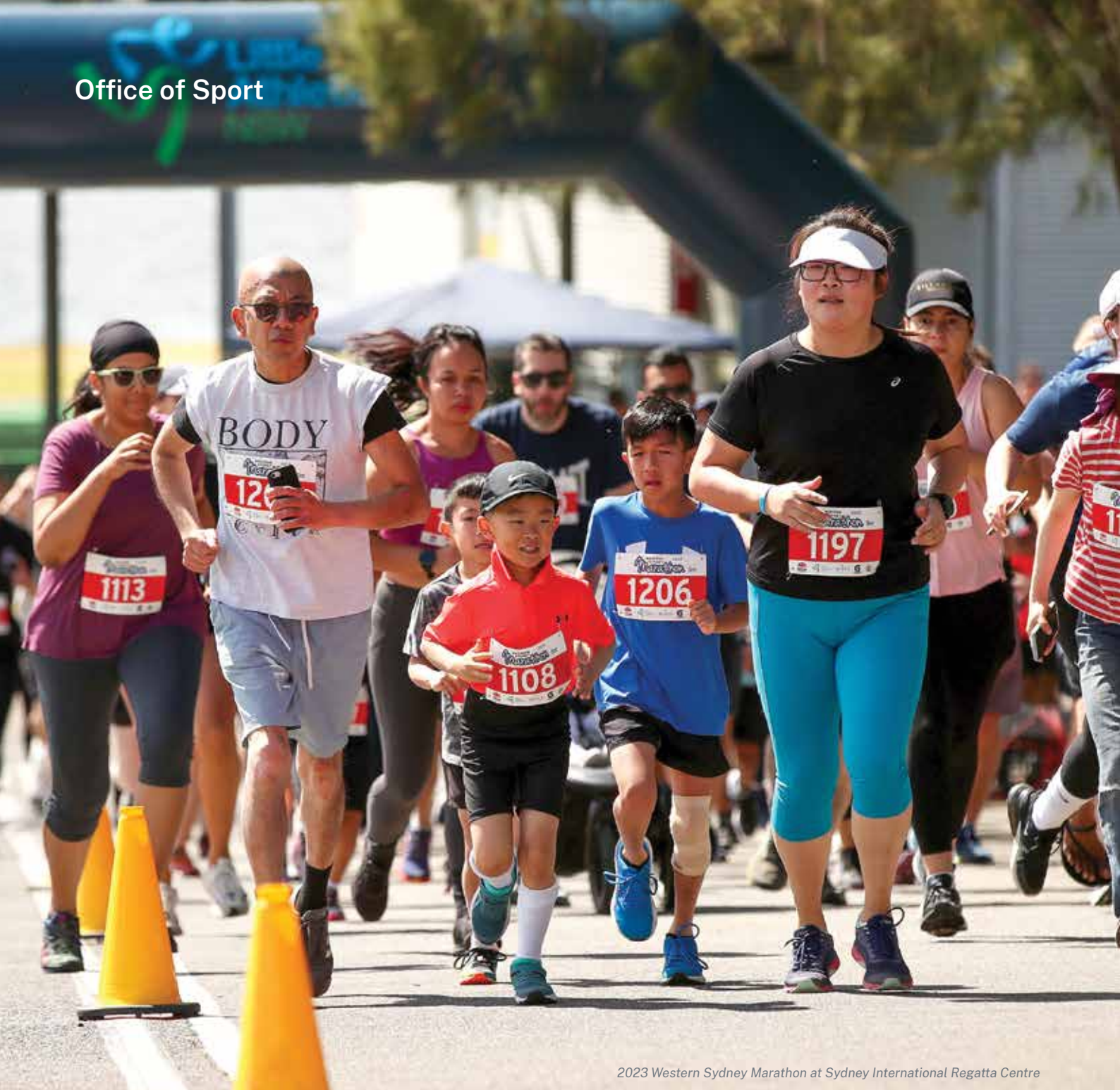
2023 Western Sydney Marathon at Sydney International Regatta Centre