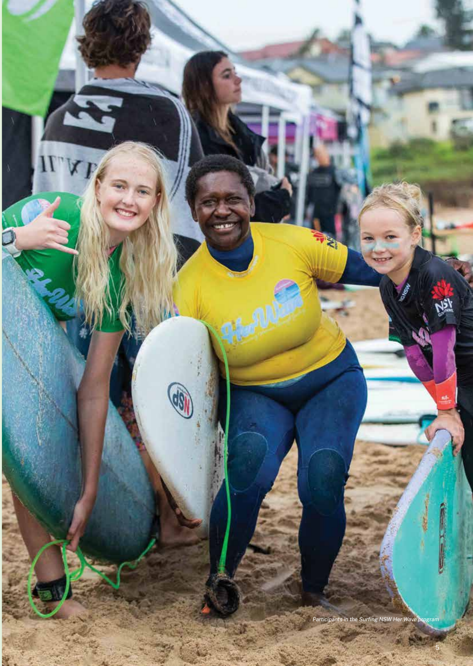
Participants in the Surfing NSW Her Wave program