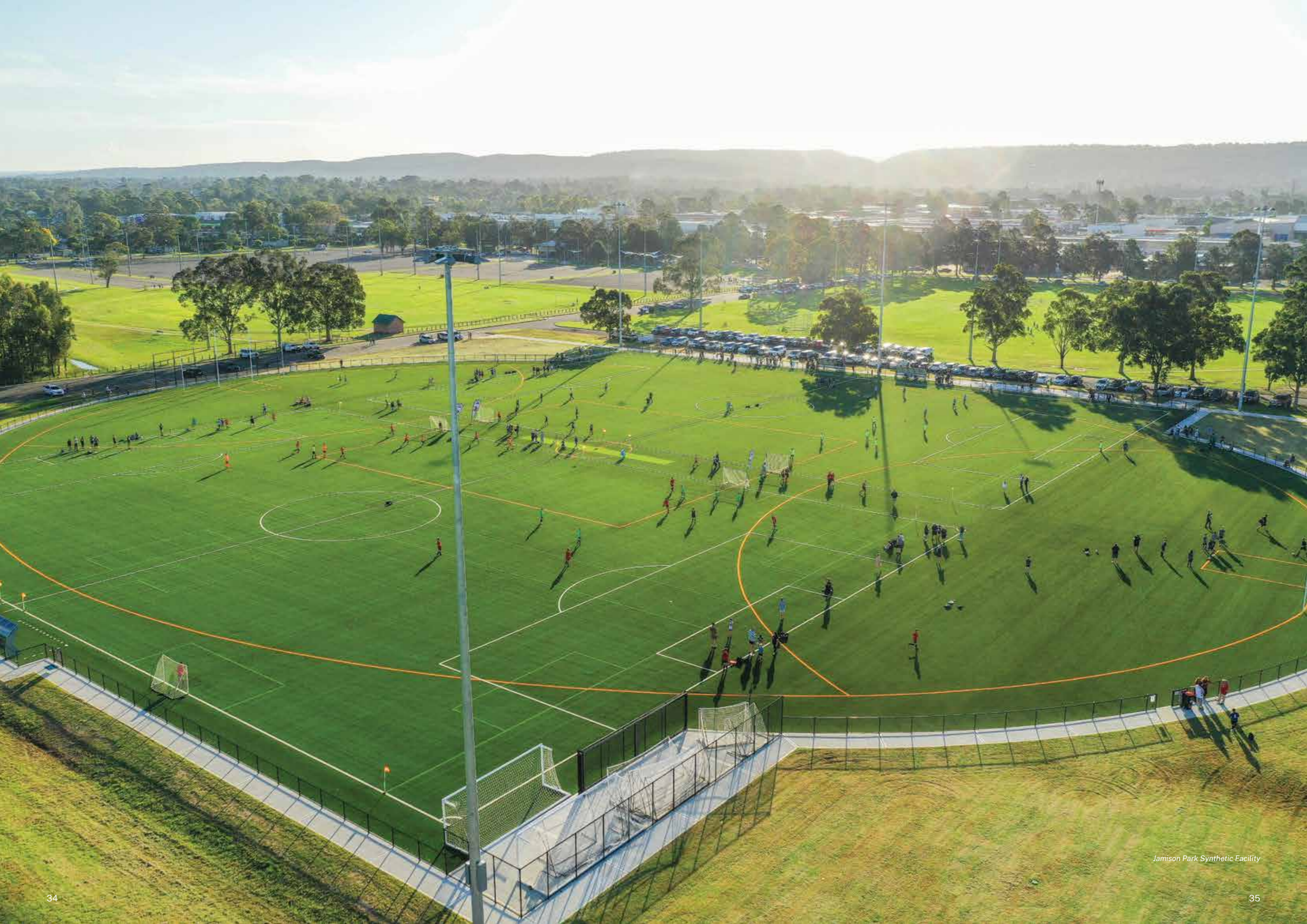
Jamison Park Synthetic Facility