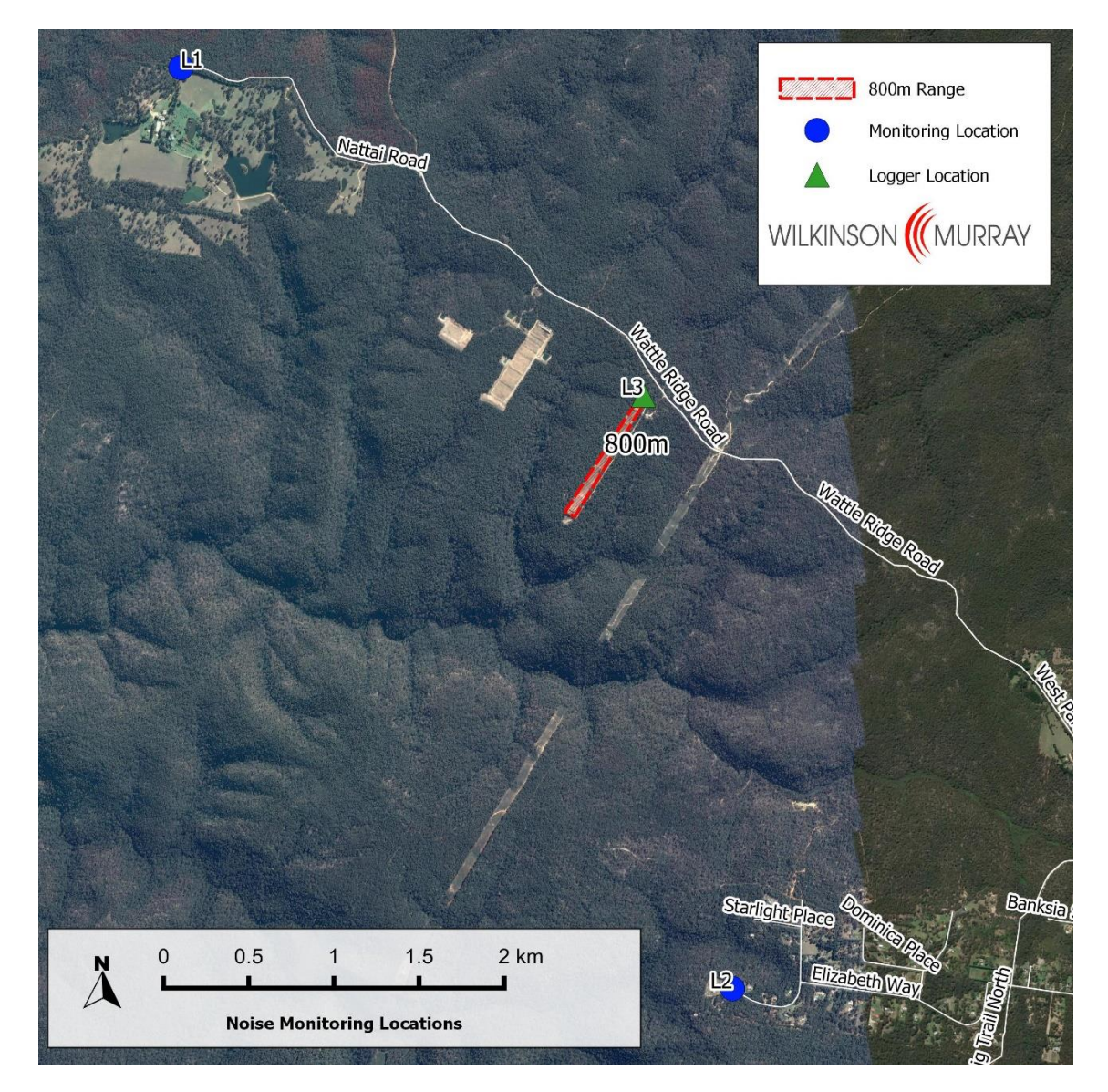
Figure 3-1 Noise Monitoring Locations